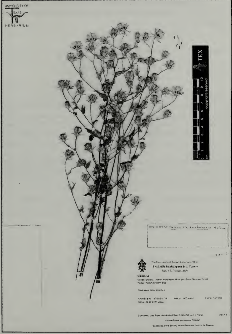
Fig. 3. Brickellia huahuapana (Holotype).